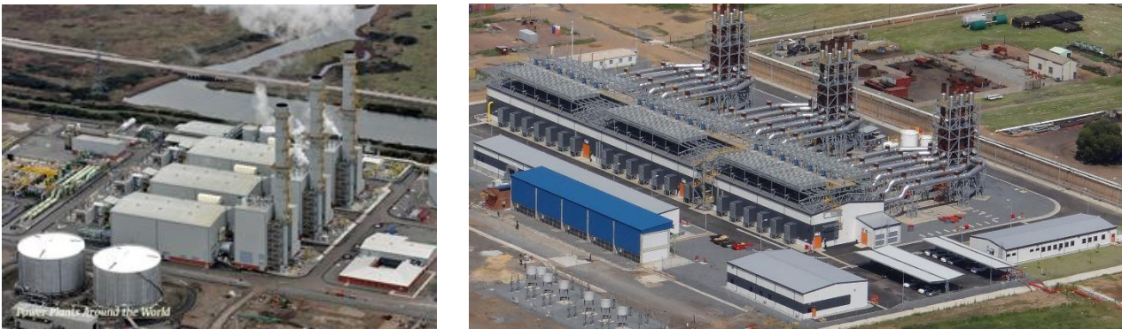
Figure 2: Examples of gas to power plant sites

The final selection of technology that will form part of the power generation component of the CTT project has not been determined at this stage. The two power generation technology options that are currently being evaluated are: